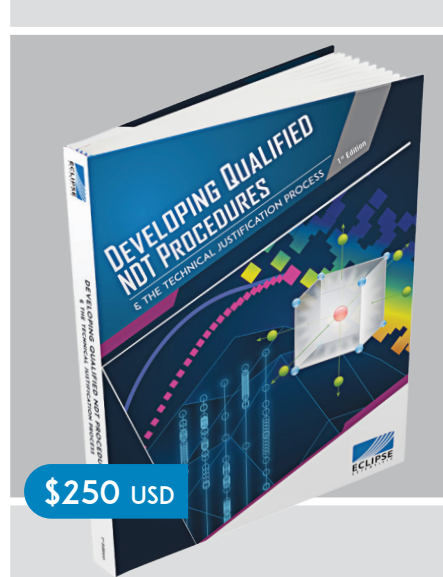
Developing Qualified NDT Procedures & The Technical Justification Process - 1st Edition