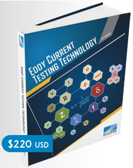
Eddy Current Testing Technology - 2nd Edition