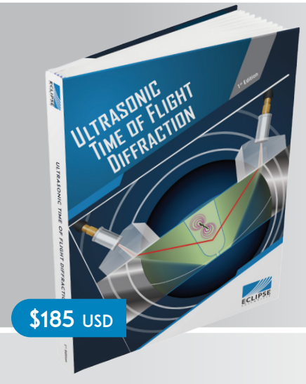
Ultrasonic Time of Flight Diffraction - 1st Edition