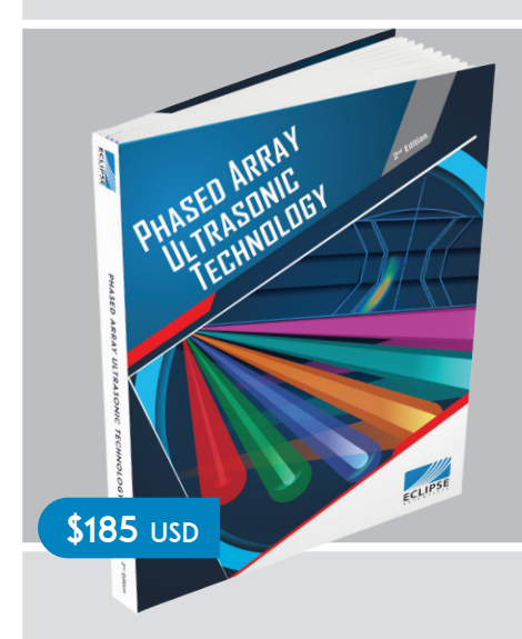
Phased Array Ultrasonic Technology - 2nd Edition