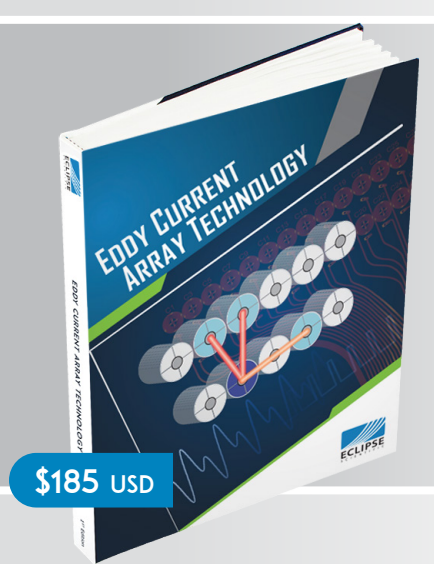
Eddy Current Array Technology - 1st Edition